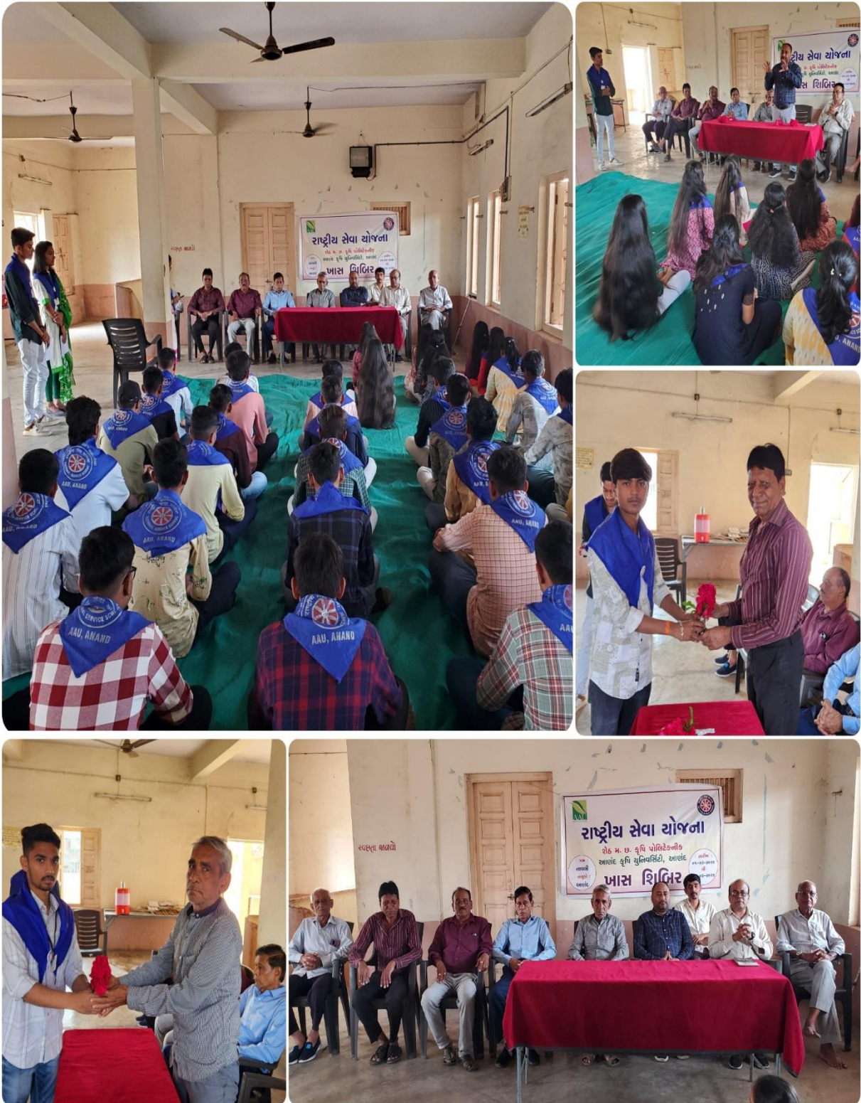
Camp Inagural function in presence of Principal of the polytechnic and Village leaders