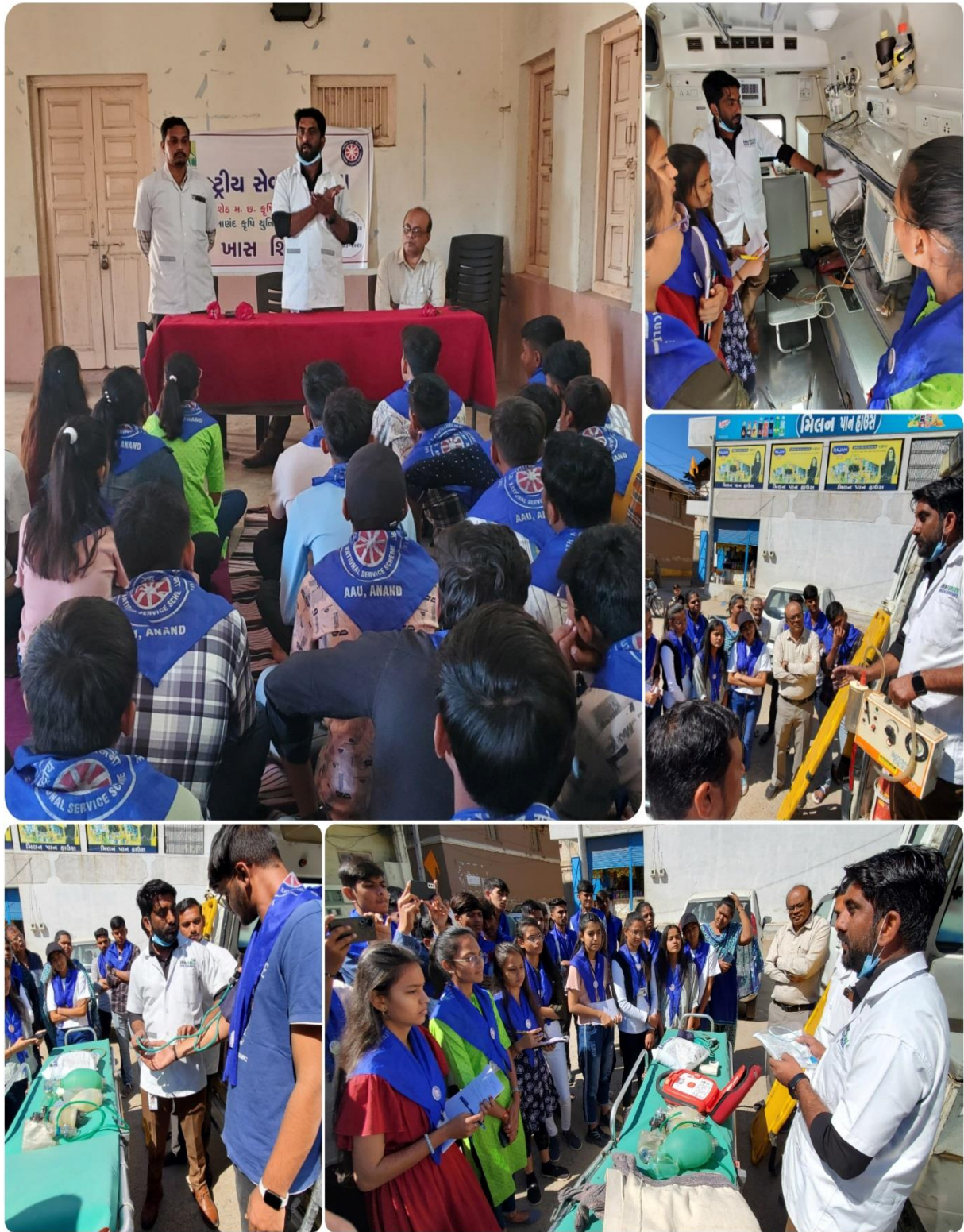
Special talk and Emergency awareness Live demonstration by 108 team