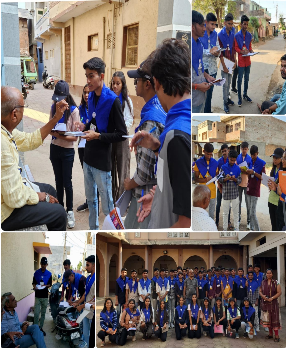
Village Survey and Invitation to villagers of Ingrual function and camp activities