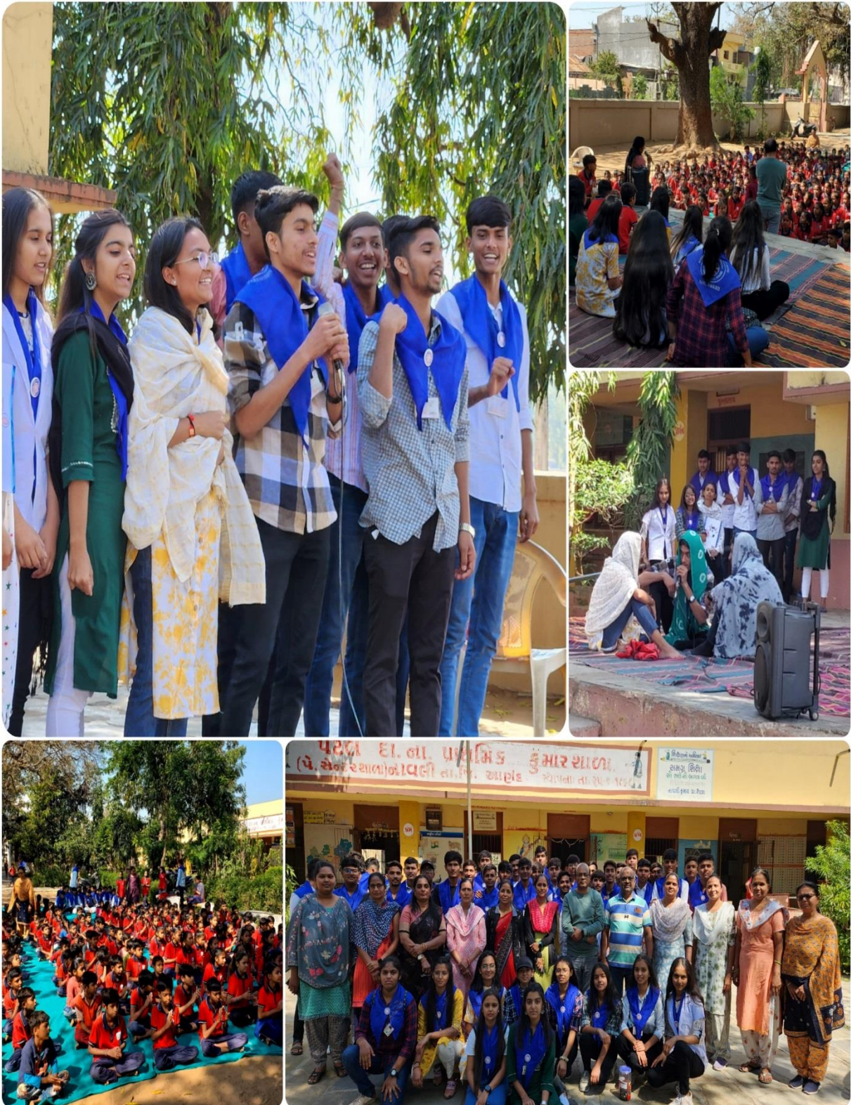
Awareness plays on awareness of plastic use and mobile addiction in Boy's primary school by NSS Volunteers