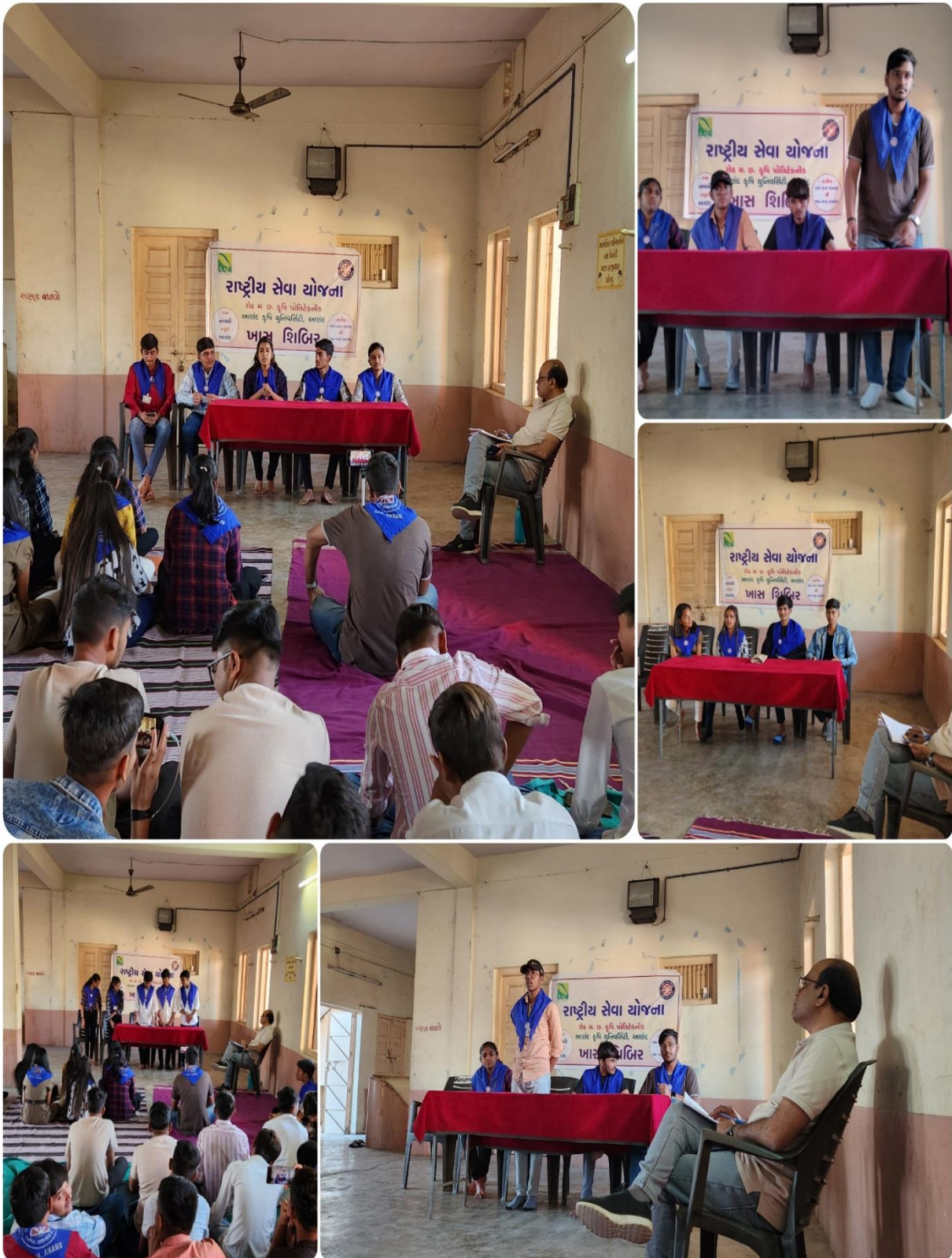
Panel Discussion on Various Relevant National Issues