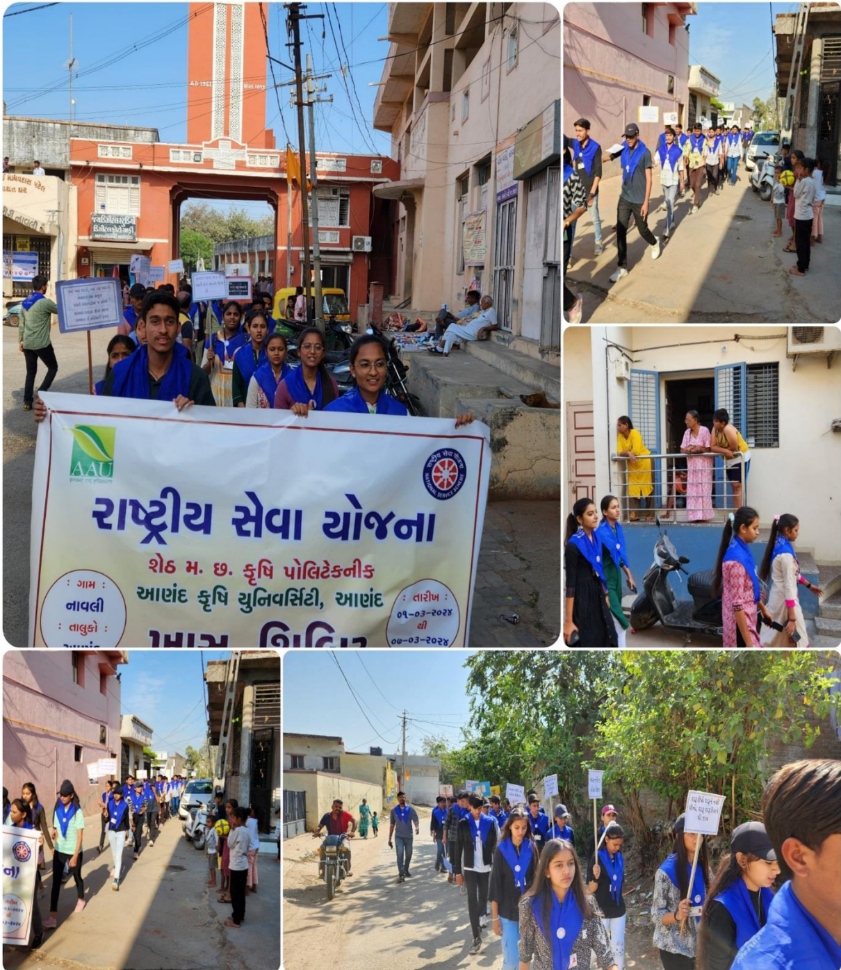
Awareness Rely on Swachchhta (cleanliness) by NSS Volunteers