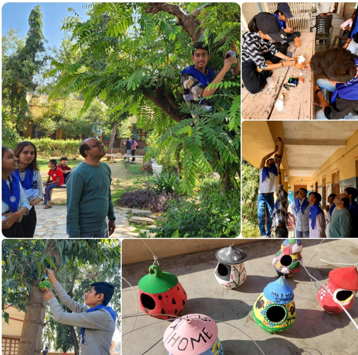
Awareness on Sparrow protection and Installation of sparrow nests