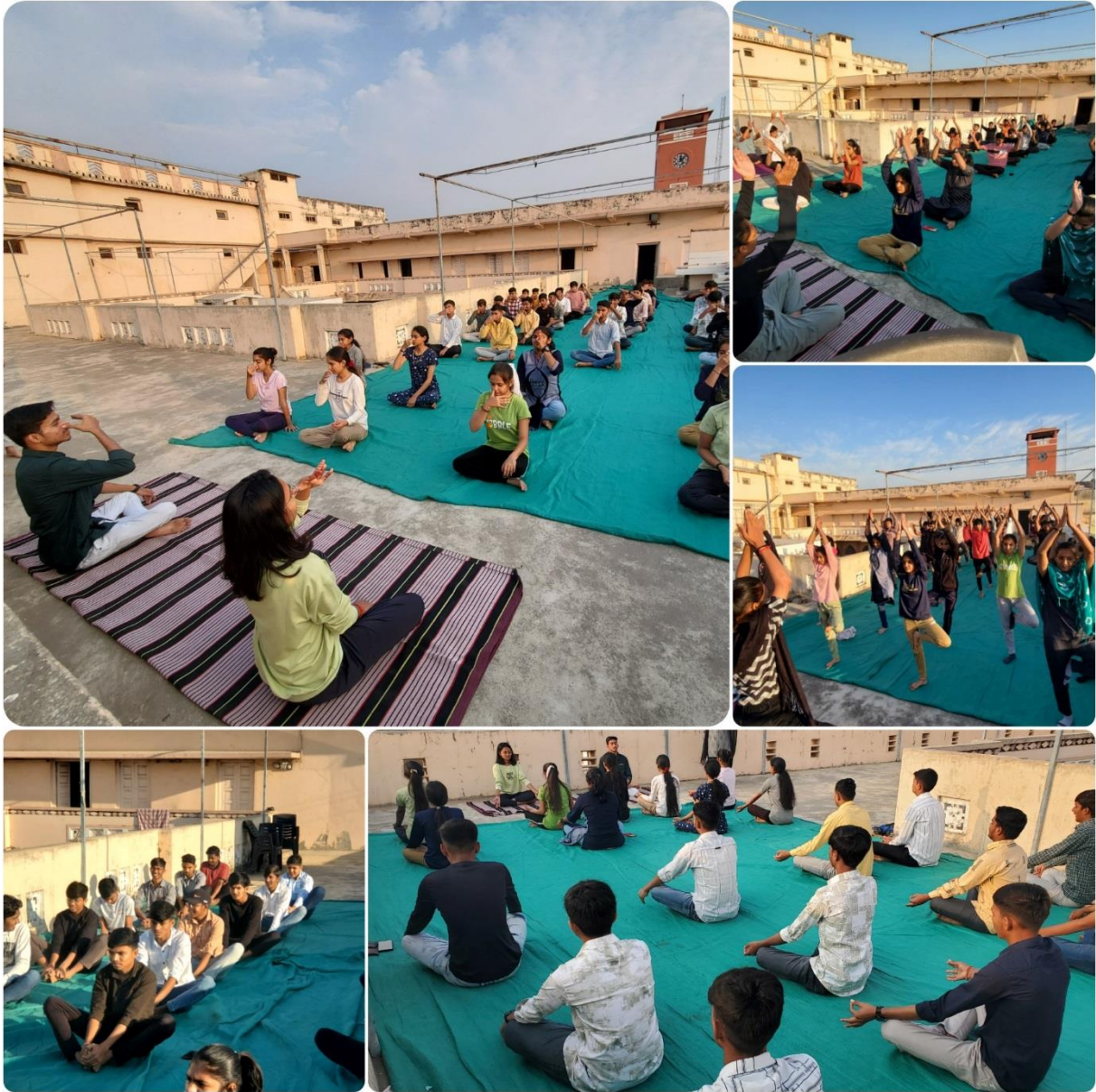
Yoga & Meditation a daily activity in the early morning during the camp

"Special Camp of NSS at Navli village from 1 st March to 7 th March, 2024