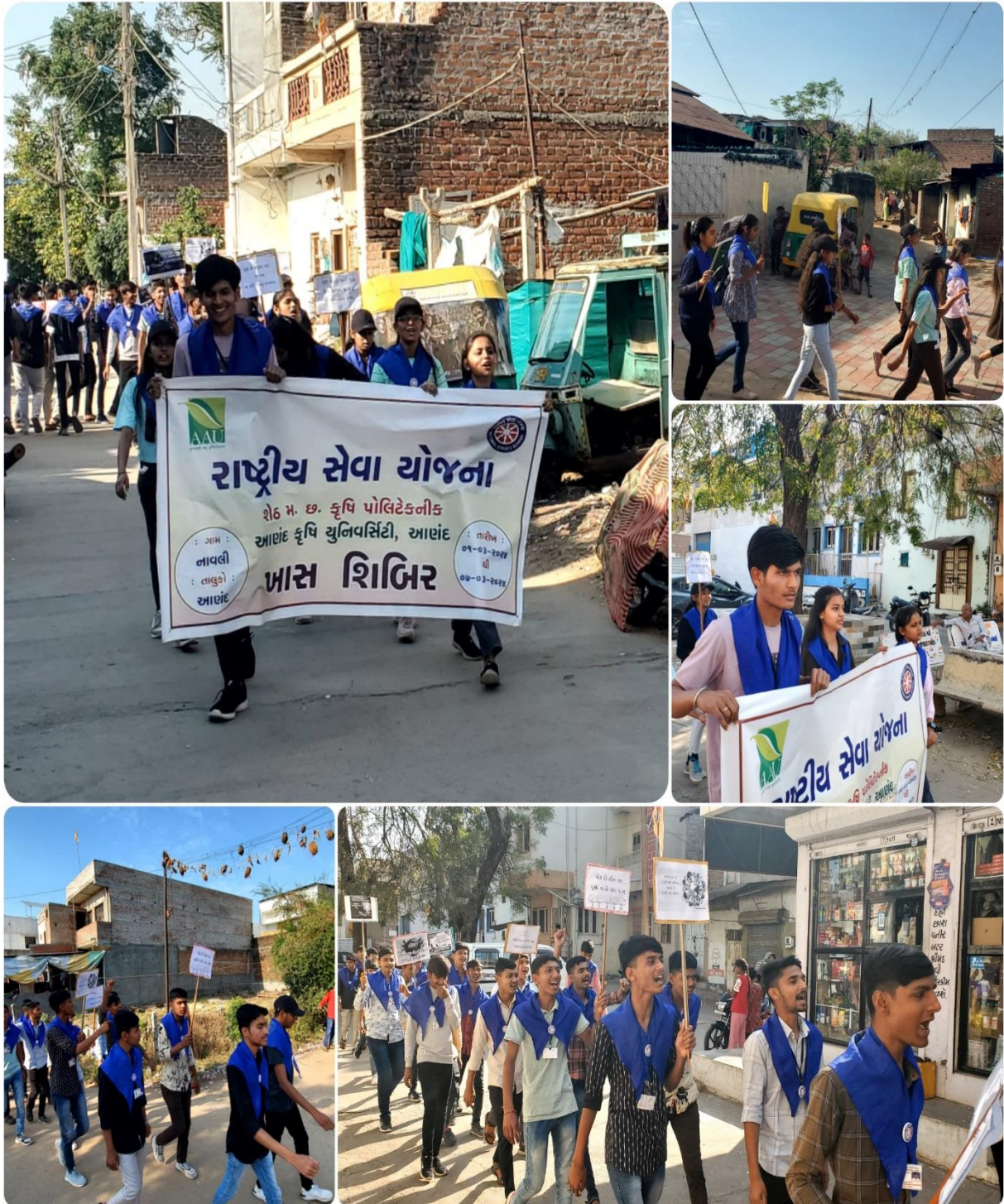
Awareness rely on Environment Protection