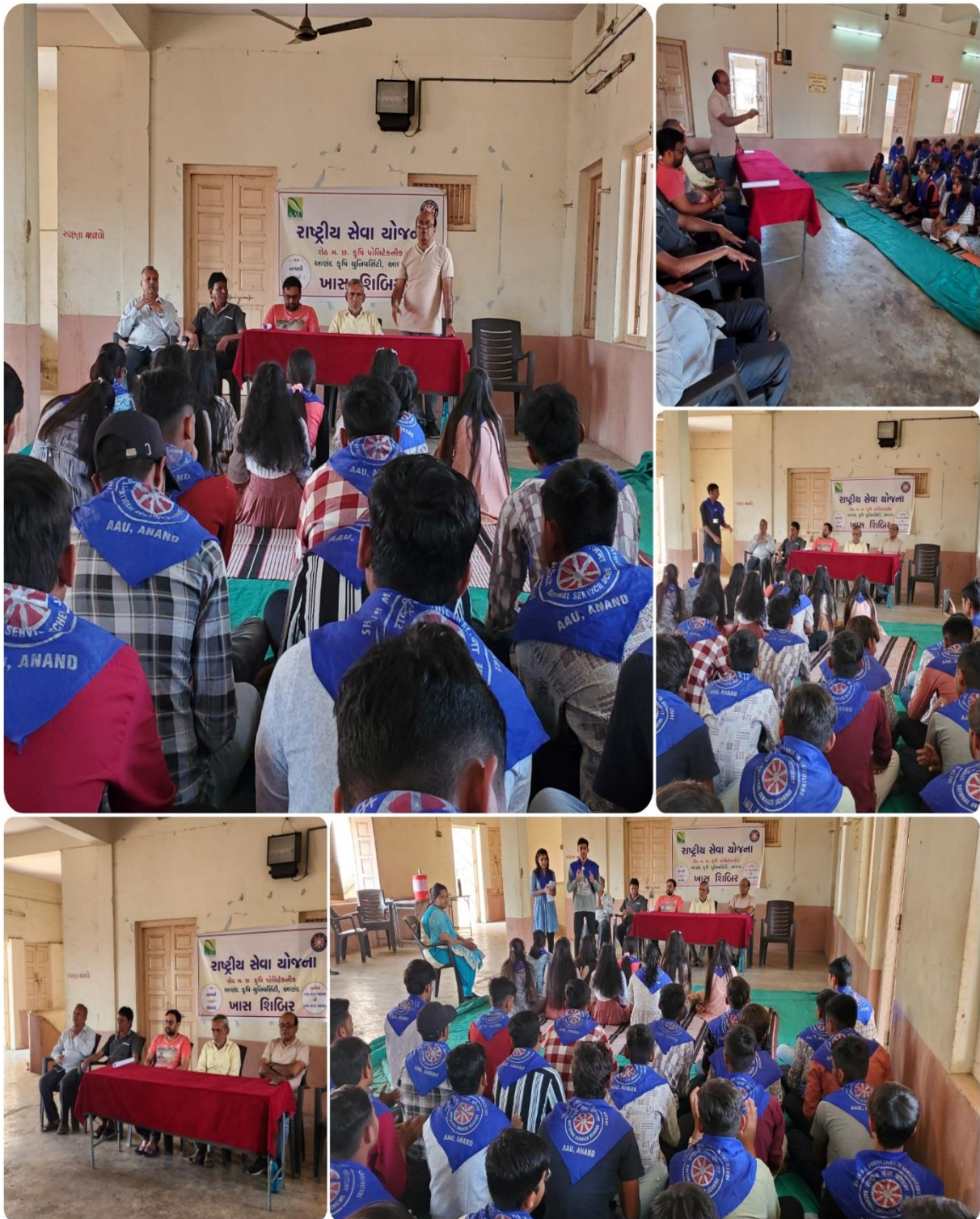
Validatory Function in the presence of Village leaders