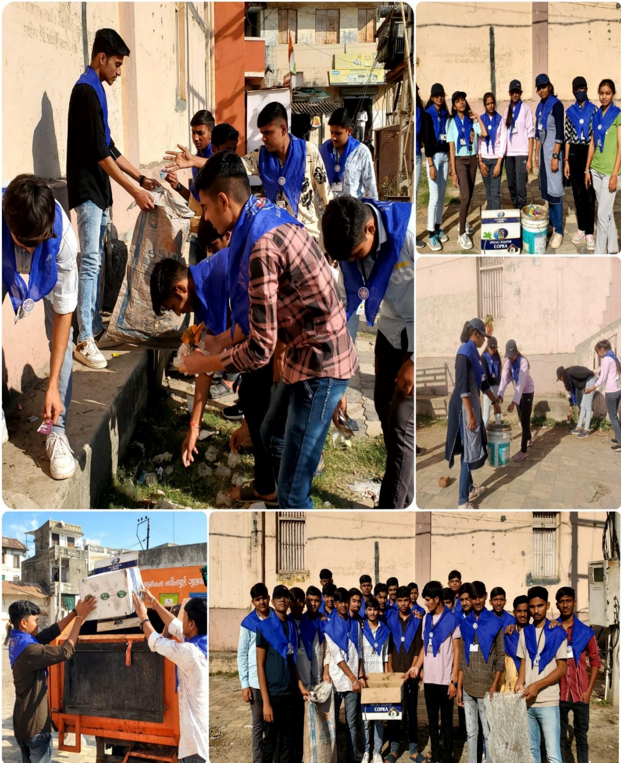
Cleanliness campaign of various public places of the village